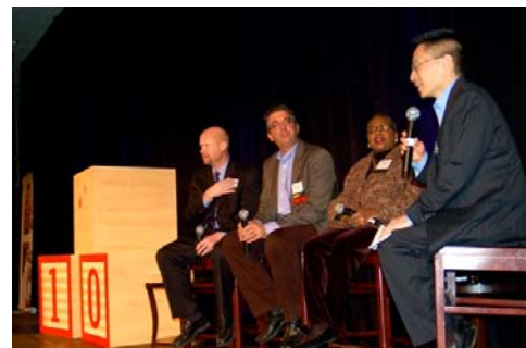
Luncheon panel discussion